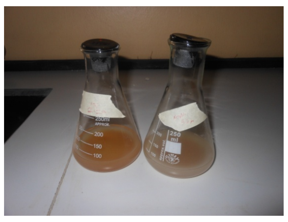
Figure 2: Sample of reactants in conical flasks