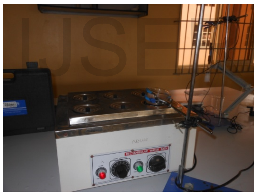
Figure 3: Water bath used for the experiments being calibrated