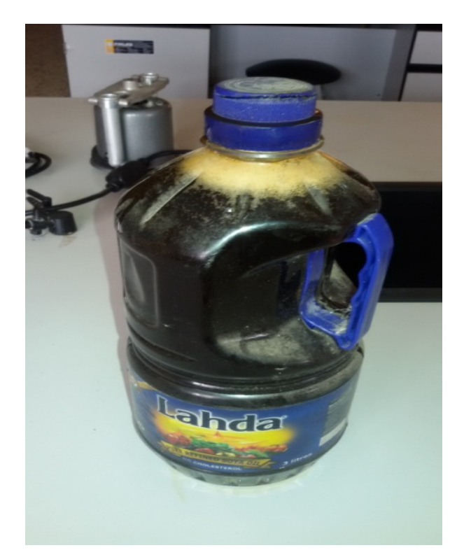
Figure 1: Waste cooking oil collected from ABUAD cafeterias