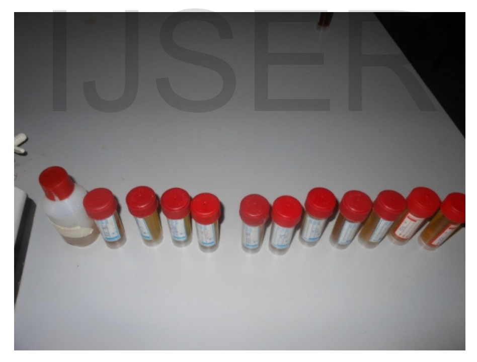
Figure 5: Samples of biodiesel produced