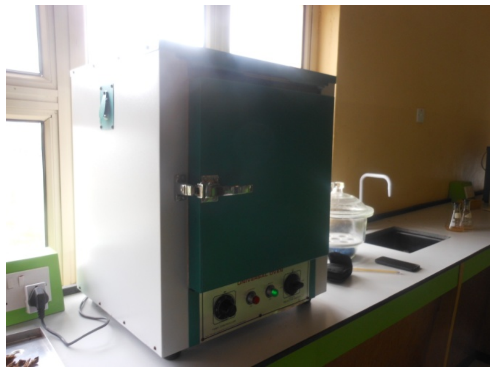
Figure 4: The oven used for the experiment