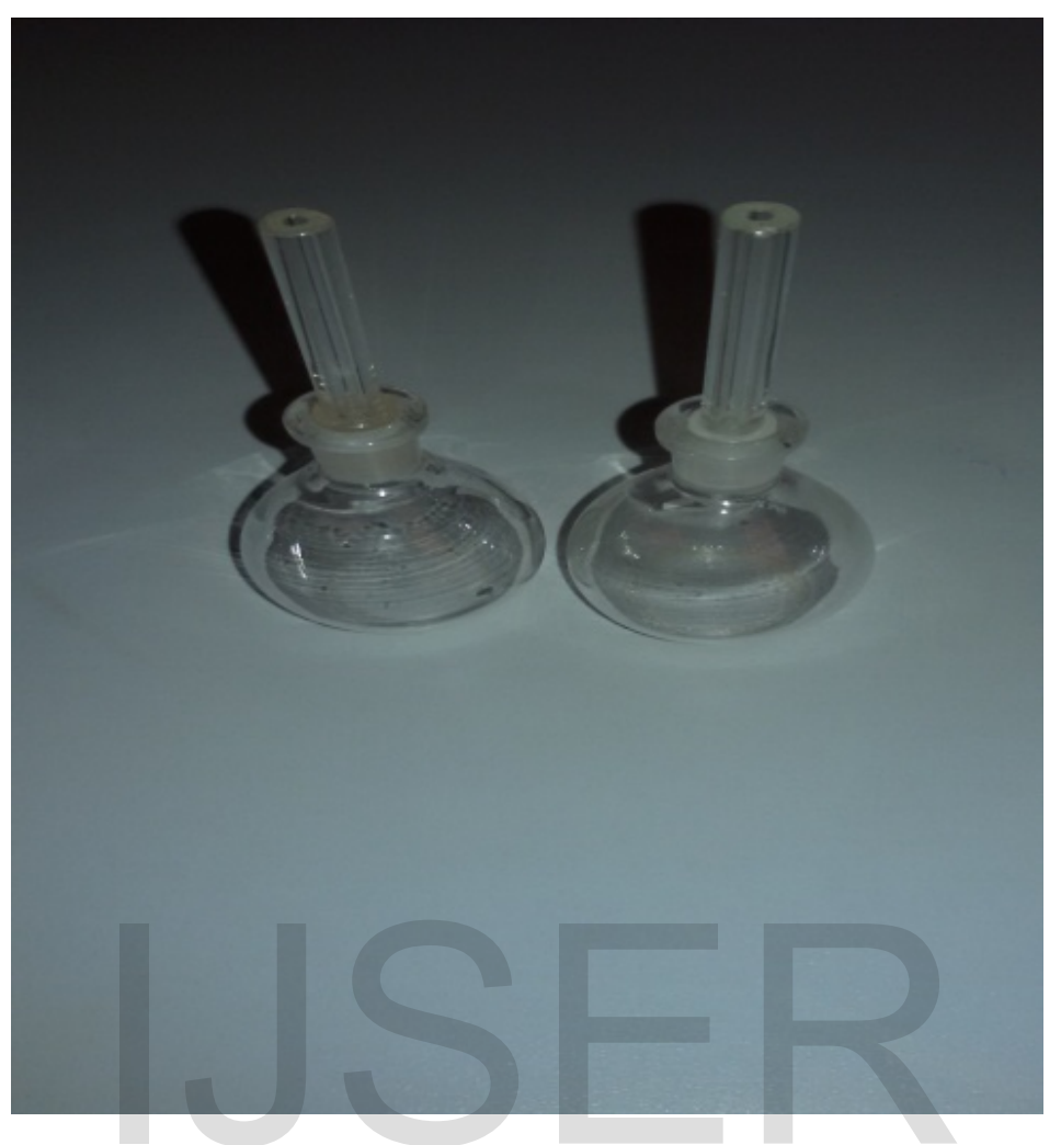
Figure 7: Density bottles