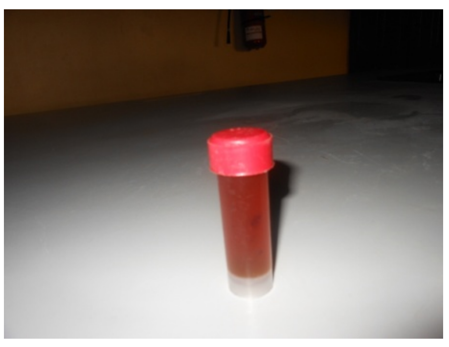
Figure 6: Sample of glycerol obtained

After the production of the twelve (12) samples of the biodiesel, the percent yield obtained from each of the runs was calculated, using Equation 1, and inputted into the Design-Expert, and the entire results were analysed using quadratic process model with manual selection, which was later modified using backward selection.